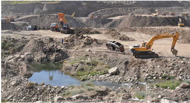
The Tajik government has reportedly agreed to give Xinjiang Tebian Electric Apparatus Stock Co. Ltd (TBEA) the rights to further mining deposits if the profit made from two gold deposits doesn't cover the cost of building the Dushanbe-2 combined heat and power (CHP) plant.

ligation has been taken not by TBEA, but by the Tajik government itself.