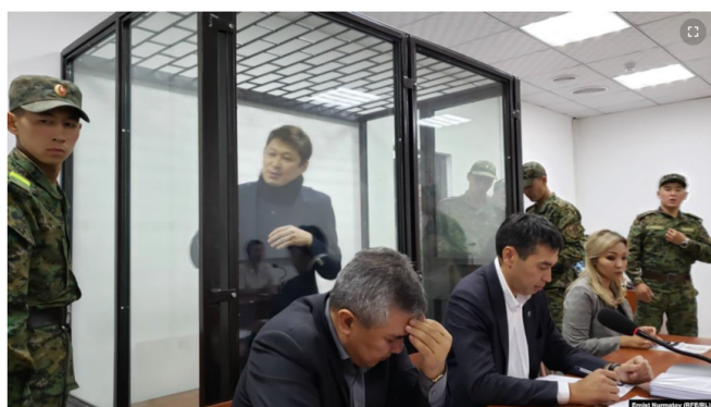
Sapar Isakov was sentenced to 15 years.

Two former Kyrgyz prime ministers, Sapar Isakov, and Jantoro Satybaldiev have been arrested in connection with this scandal. Isakov was sentenced to 15 years in prison on corruption charges. The prosecutor claimed, he also used his influence to lobby the Chinese company TBEA during the tender for the thermal power plant project. Satybaldiev is the second prime minister to be arrested for taking a bribe during the implementation of the project and sentenced to 15 years in prison.