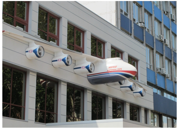
The front of a plane is mounted on the administrative center of the Motor Sich engine factory in Zaporizhzhia, Ukraine. The factory employs tens of thousands in Ukraine's fragile east.

Following Zelensky's sanctions, the Ukrainian SBU conducted the searches in Zaporizhzhia, interfering with the board meeting of "Motor Sich" shareholders. As stated in their report, they accuse the Skyrizon and other owners of 'illegal provision for the destruction of the joint-stock companys production capacities , which carry national economic and defense importance for the country.