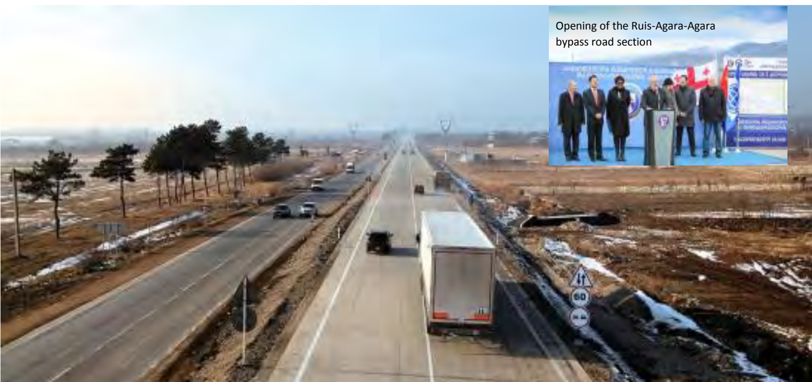
Opening of the Ruis-Agara-Agara bypass road section

https://www.autocar.ge/index.php?option=com_content&view=article&id=6418:ruisi-agaras-3-kilometriani-monakvethi-ramdenime-dgheshi-gaikhsneba&catid=214&Itemid=158&lang=ka-GE